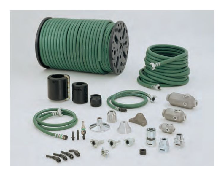
If you're using Sullair tools, get the performance you paid for. Use only genuine Sullair accessories.